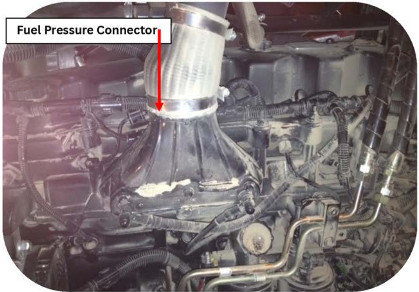
Step 7) Engine Compartment in a 6.7L Puma