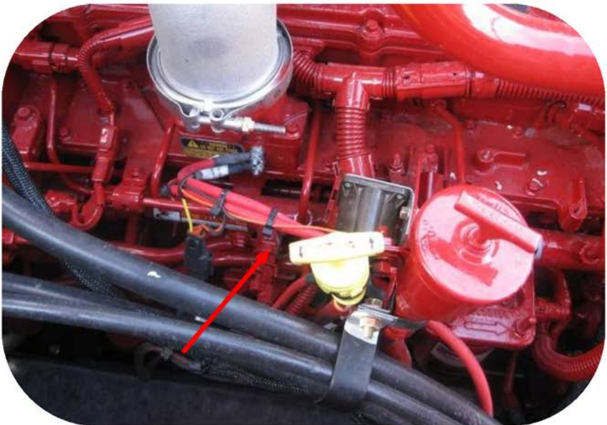
Step 8) 8.3 L & 9.0L Cummins Fuel Pressure Sensor in 88 series combine