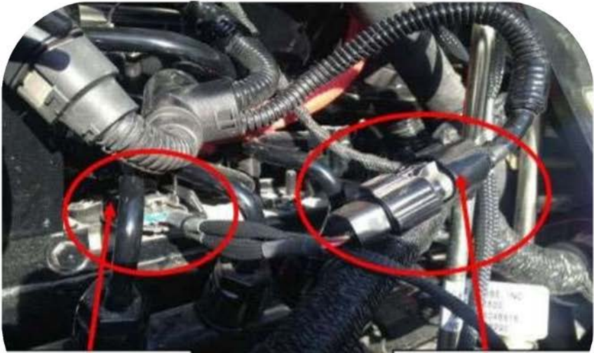
Stock male MAP Sensor

Step 7) Unplug the factory MAP sensor and plug the Ag Diesel Solutions MAP sensor connector into the factory harness.