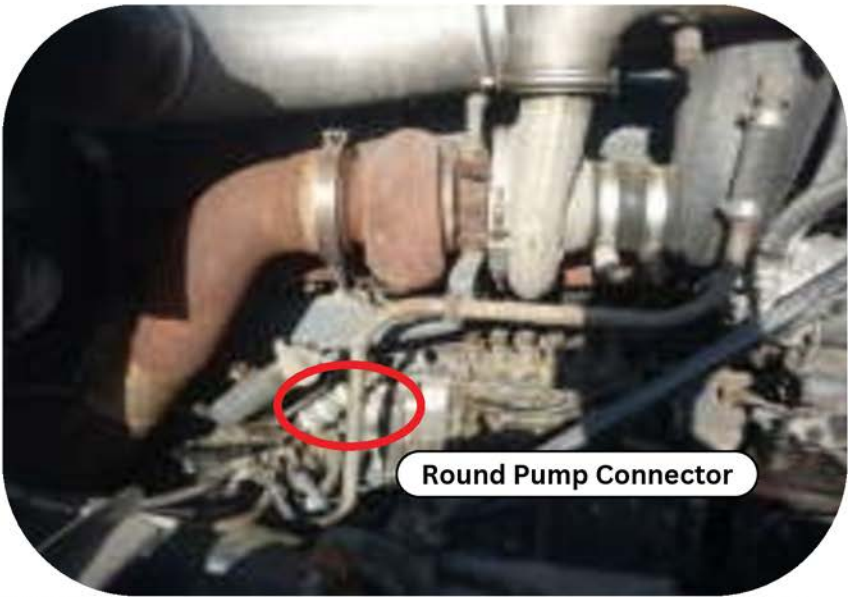
Round Pump Connector

Step 1) Locate Engine Connectors on Passengers side of Engine